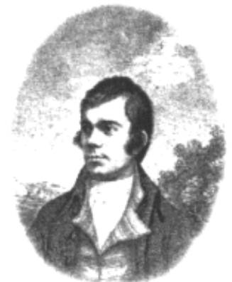
Robert Burns 1759 — 1796